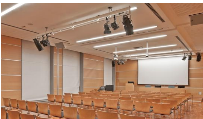
Artificial lighting, darkened room