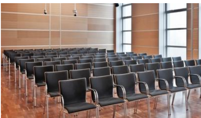
Chairs by Thonet