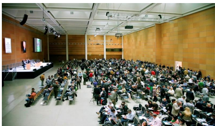
Divided room, Medical-scientific National Congress