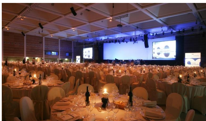
Corporate Event, catering area