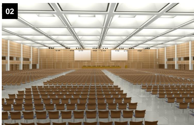
01. hall location, section ground floor 02. inside view, 4,700 seats