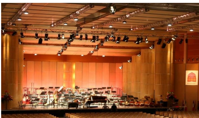
Cultural Event, suspended equipment