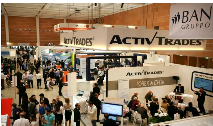
Corporate Event, exhibition area