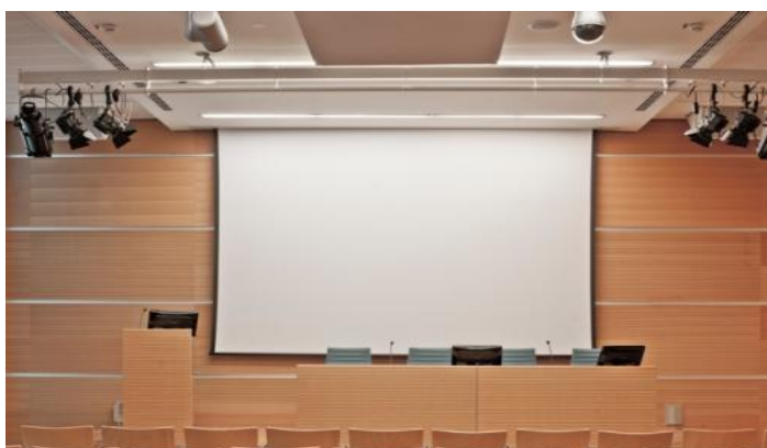
Screen, video camera, reflectors, podium