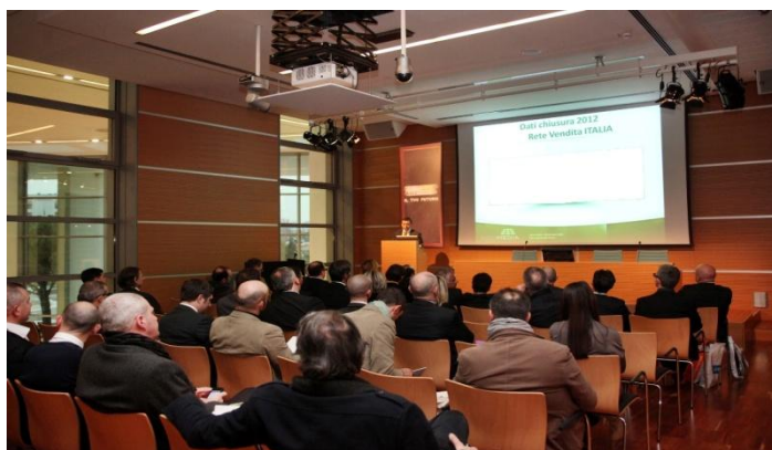
Medical-scientific National Congress