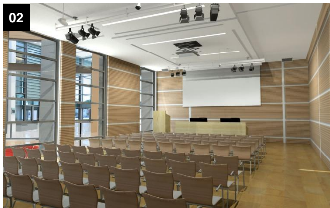
01. room location, section floor 1 02. inside view, 110 seats