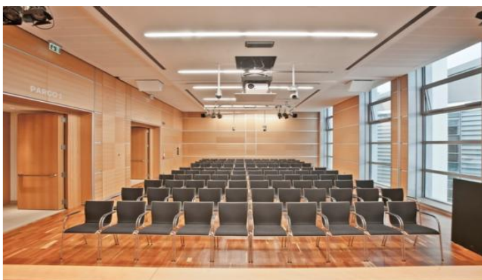
Chairs by Thonet