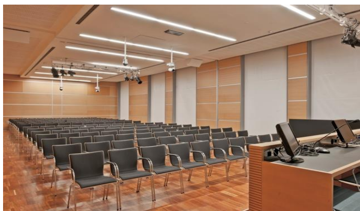
Darkened room, chairs by Thonet