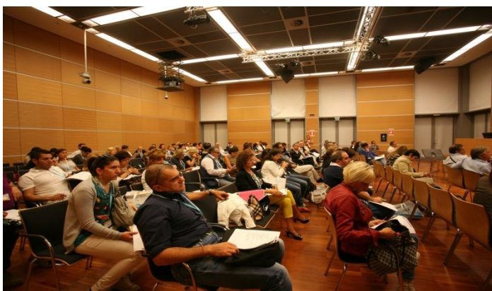
Divided room: Medical-scientific National Congress