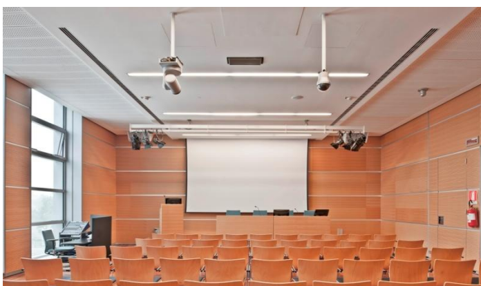
Screen, video camera, reflectors, podium