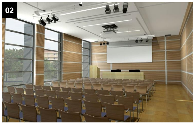
01. room location, section floor 1 02. inside view, 165 seats