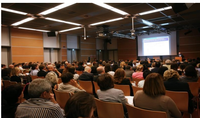
Medical-scientific National Congress