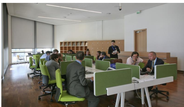
Medical-scientific National Congress