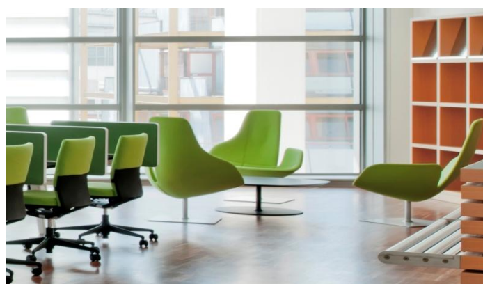
Armchairs by Moroso