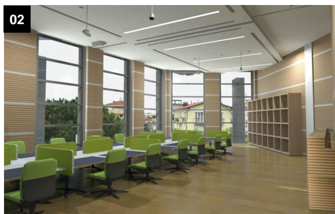
01. room location, section floor 1 02. inside view, 86 seats