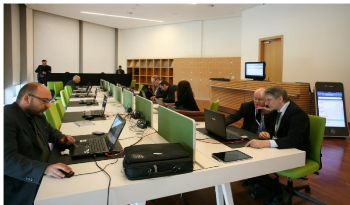
Medical-scientific National Congress