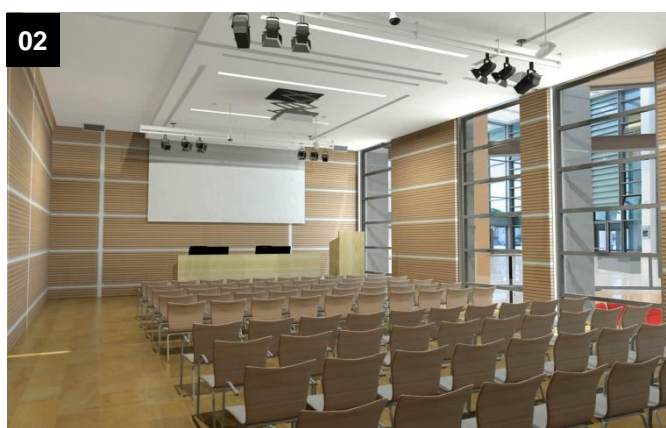
01. room location, section floor 1 02. inside view, 110 seats