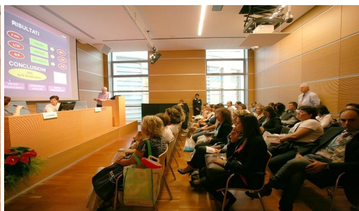
Divided room, Medical-scientific National Congress