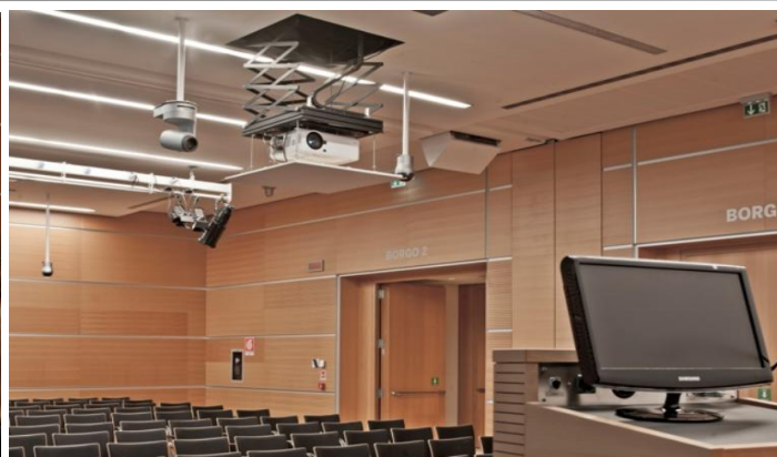
Video camera, reflectors, videoprojector