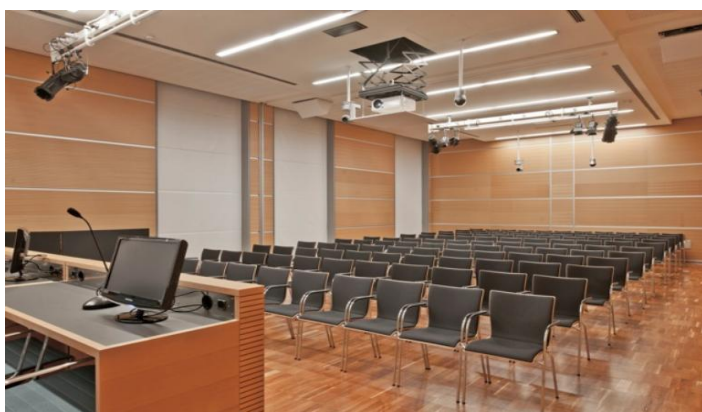
Darkened room, chairs by Thonet