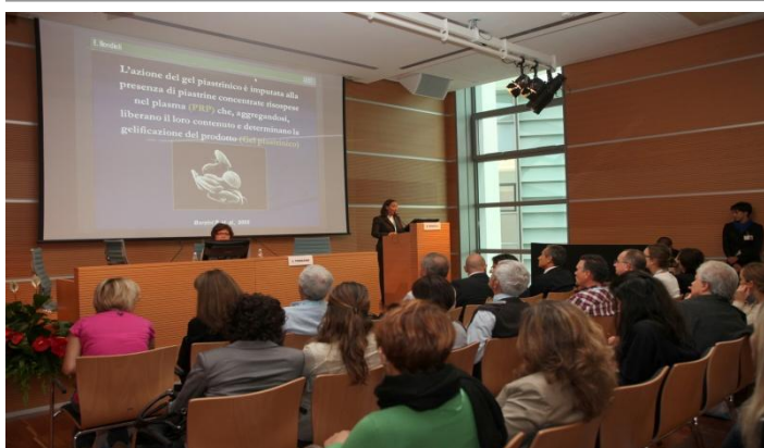
Medical-scientific National Congress