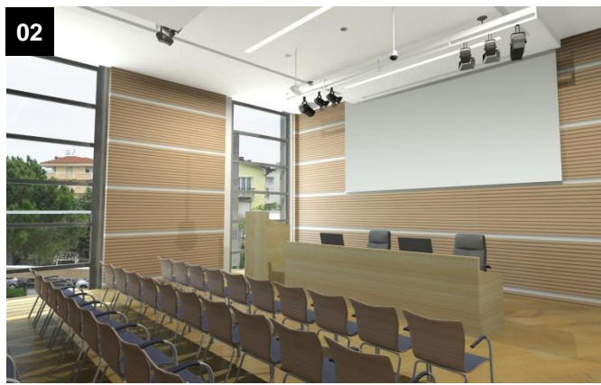
01. room location, section floor 1 02. Inside view, 40 seats