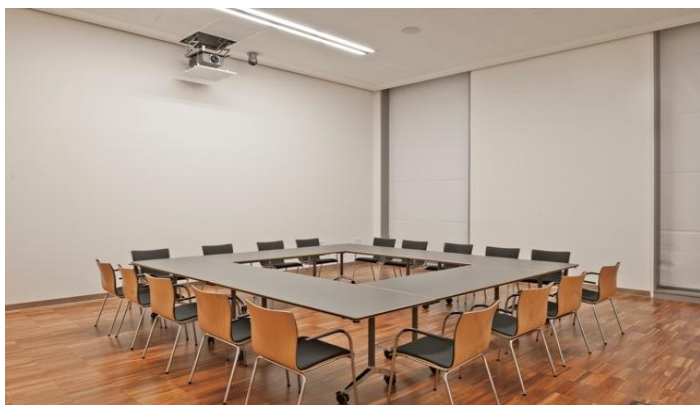
Artificial light, darkening system