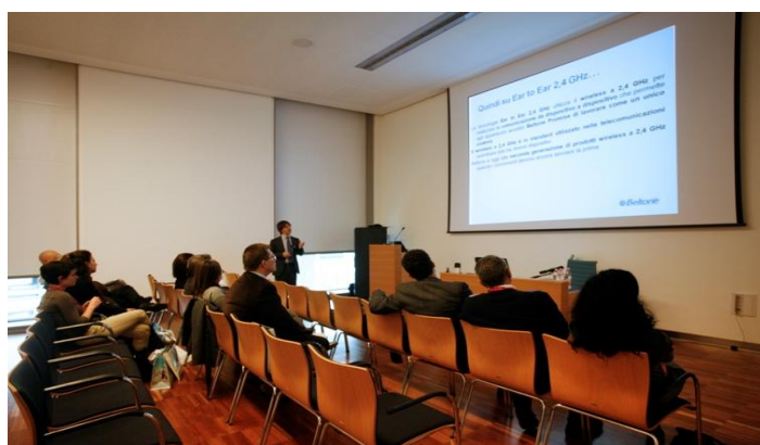
Medical-scientific National Congress