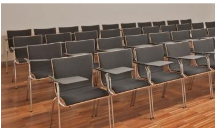
Chairs by Thonet