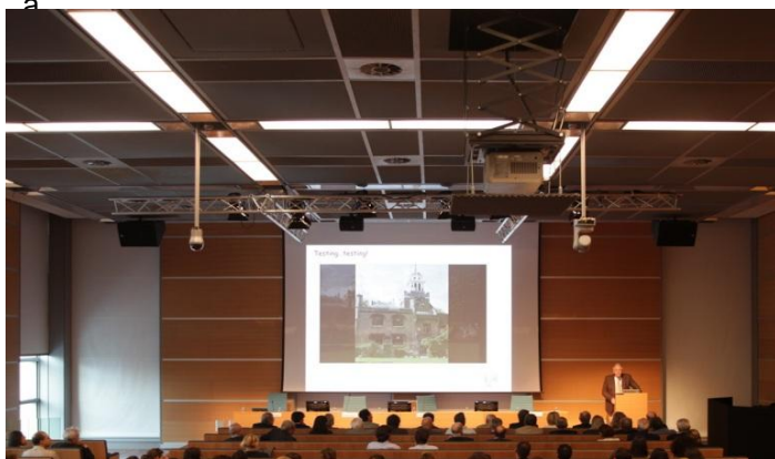
Screen and technical equipment