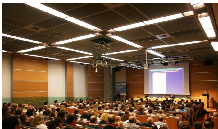
Medical-scientific National Congress