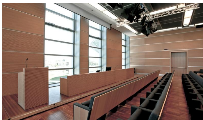
Stage, podium and speakers' rostrum