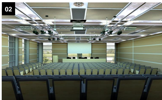
01. room location, section floor 1 02. Inside view, 282 fixed seats